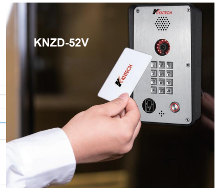
Outdoor Station KNZD-52V